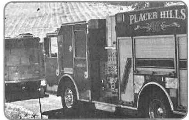
Placer Hills A